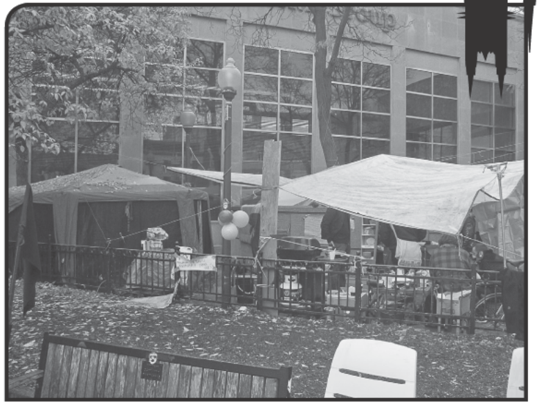
Photo of the Occupation in St. Georges Square in the centre of Guelph, Ont. Occupiers have been maintaining an encampment in the city center as an act of solidarity with the global #Occupy movement against the rich and ruling elite which influence and control the state and capital.