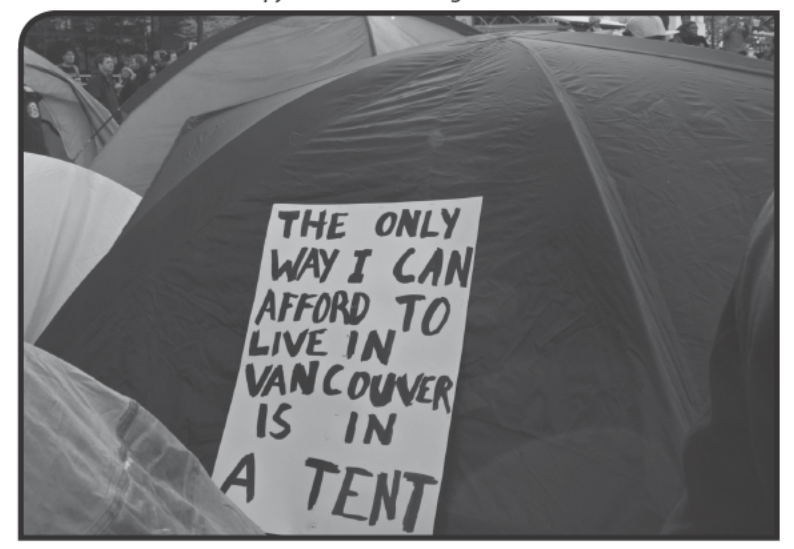
A sign on a participants tent at the Occupation in Vancouver. Vancouver has the lowest minimum wage and the highest rent in all of Canada.

...Continued from #Occupy Vancouver on Page 1