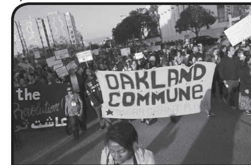
Oakland Commune banner leads the march to retake Oscar Grant Plaza after it was violently evicted by the police.

That evening, hundreds of occupiers and their supporters gathered to attempt to retake the park. Police