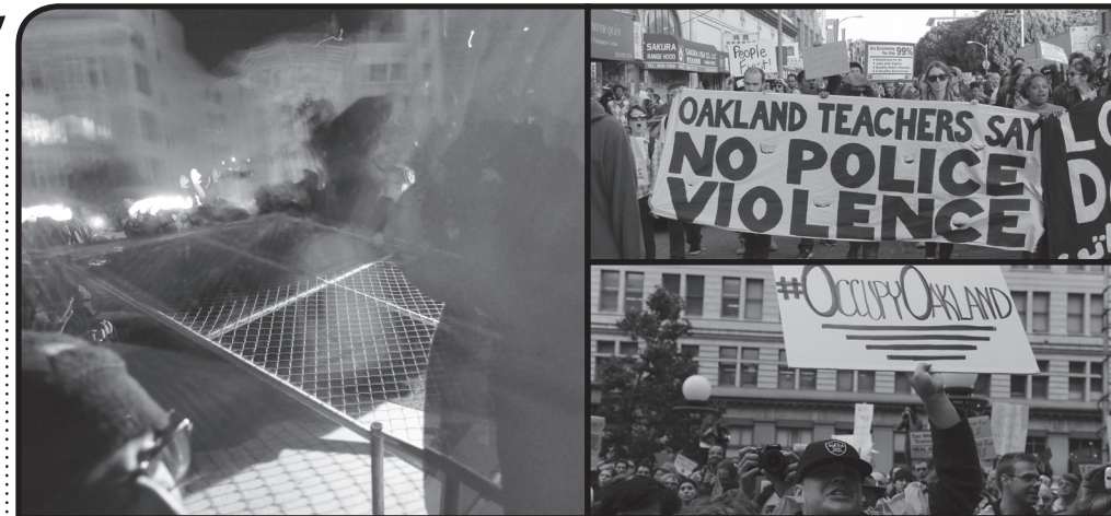
Clockwise from left — Fence comes down in Oscar Grant Plaza, Oakland teachers join Occupy March, #Occupy Oakland Sign at retaking of the park.

Since this announcement, social media has been abuzz with calls for a Global General Strike! ☺