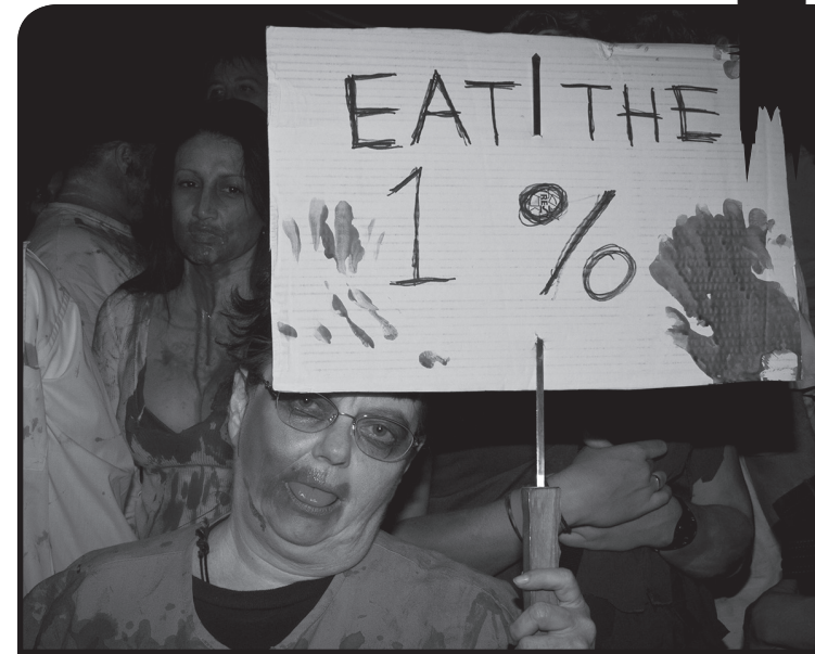
3000 zombies walk against the rich during the #Occupy Phoenix Zombie Walk. It is high time that zombies have their say in the occupy movement.